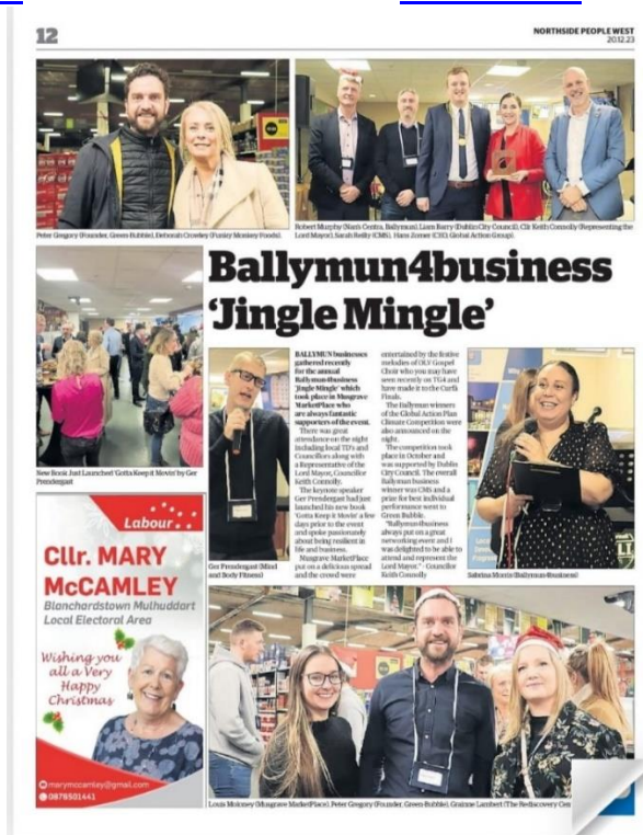
Northside People feature